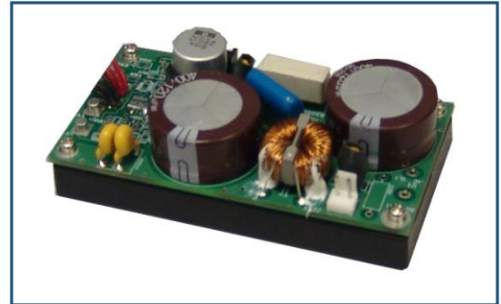
Image displays unit with EMI filter & control board