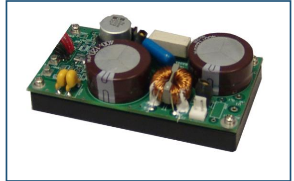
Image displays unit with EMI filter & control board